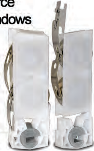
Clip for inverted config. (US Patent #10,081,972) Brake shoe w/ stop-pin (US Patent #9,371,677) Other patent info. at www.springcompany.com